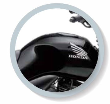
Pearl Igneous Black