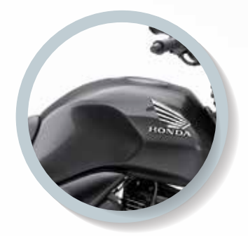
Mat Axis Gray Metallic