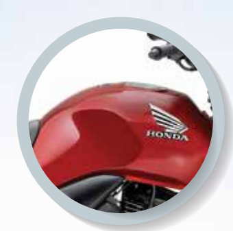
Imperial Red Metallic

Honda Motorcycle and Scooter India Pvt. Ltd., Registered Office: Commercial Complex II, Sector - 49-50, Golf Course Extension Road, Gurugram - 122018 (Haryana), India; Website: www.honda2wheelersindia.com; Customer Care: customercare@honda2wheelersindia.com